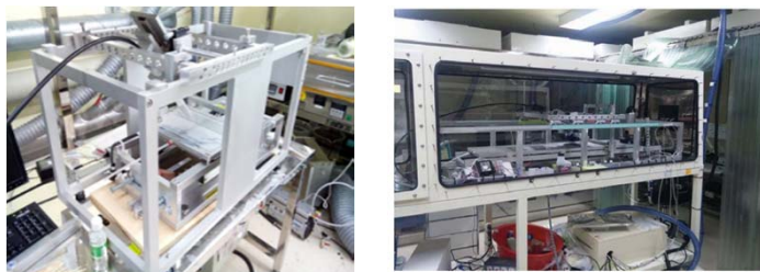
Figure 3: (Left) 30 cm automatic blade coater (Right) 120 cm coater under assembly